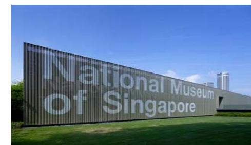
National Museum of Singapore