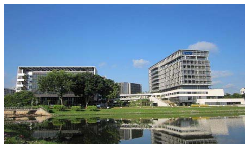
Khoo Teck Phua Hospital