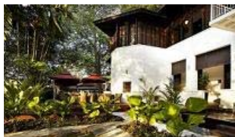
NUSS Bt Timah Guildhouse