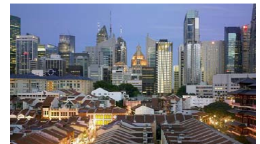
Tokio Marine Centre