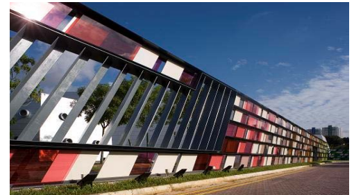
Singapore Science Centre

Ending Point: Marina Bay (i Light Marina Bay Festival)