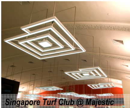
Singapore Turf Club @ Majestic