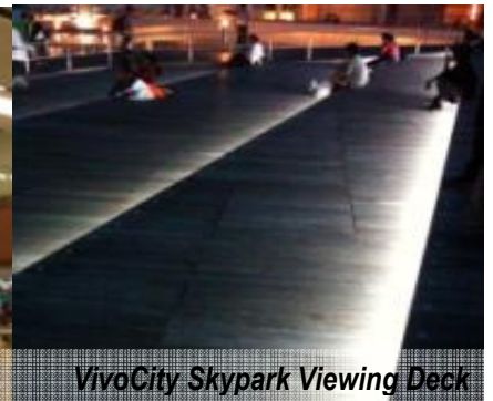
VivoCity Skypark Viewing Deck