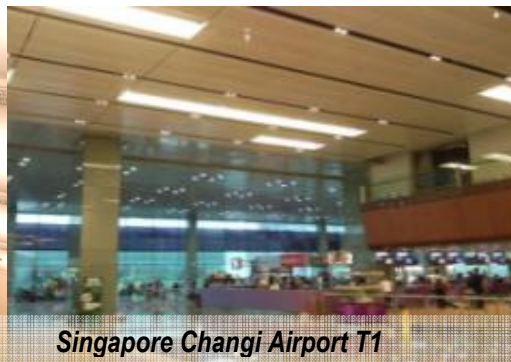
Singapore Changi Airport T1