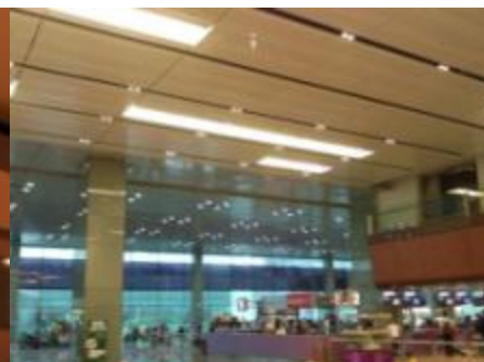
Singapore Changi Airport T1