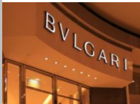
Bvlgari at Marina Bay Sands

Founded in 2000 and headquartered in Hong Kong, OPTILED Lighting International Limited is the leading expert and provider of LED functional lighting solutions. With an extensive distribution network across the North America, Europe, China, Japan, Australia, Hong Kong and South East Asia regions, OPTILED possesses the necessary skills and expertise in developing a range of environmental friendly lighting products. OPTILED also aims to shape the future of light by leading the world into a new era of lighting based on LED technology.