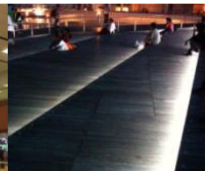
VivoCity Skypark Viewing Deck