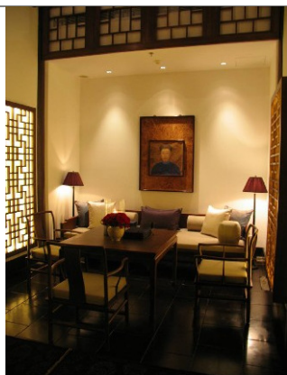
Guest Room in Aman at Summer Palace

6.30pm Registration & Light Refreshment 7.00pm Welcome Remarks by SIA 7.05pm Presentation on “Art and Architecture” 8.30pm Questions & Answers 9.00pm End