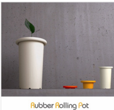
Rubber Rolling Pot