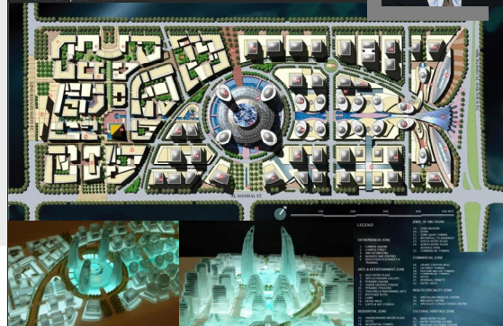
Al Manhal, Iconic Mixed Use Development, Abu Dhabi, UAE Site Area: 61 Ha Year of Completion: 2005

This scheme made good use of landscape in a fairly tight site (e.g. green walls on the exterior of condo, residential block, exterior of car park and pool side). The provision of greenery in communal space (i.e. skyrise gardens) contributes to the lush environment. The green walls surrounding the car park structure soften an otherwise harsh façade to its neighbours while the vertical greenery that extends 30 floors up the building adds a dramatic touch to the building. Maintenance of the greenery is taken into consideration, where the green wall can be accessed via the escape staircase landing on every floor. It is a commendable effort for Newton Suites to achieve a green area which is 130% of its site area.