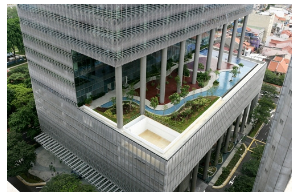
One George Street (Best Skyrise Greenery)