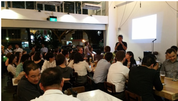
SIA Young Architecture League (YAL) Members Night

Thursday 29 January 2015 - The architecture fraternity have a good time at The Refinery reconnecting with friends and making new connections with fellow architects in Singapore.