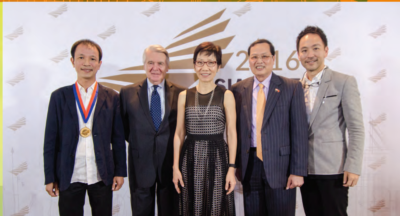
MORE ON PAGE 7