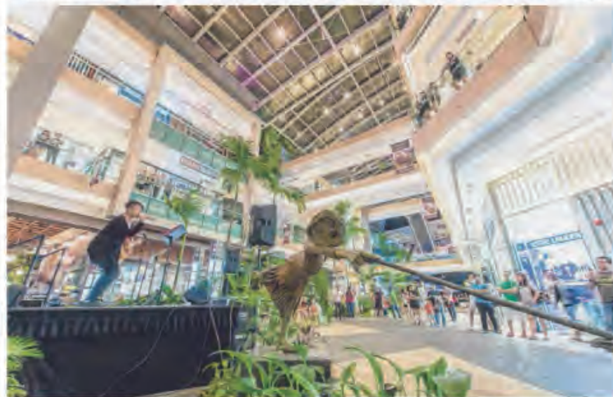
The Courtyard in Westgate has a designated area for buskers and live performers.