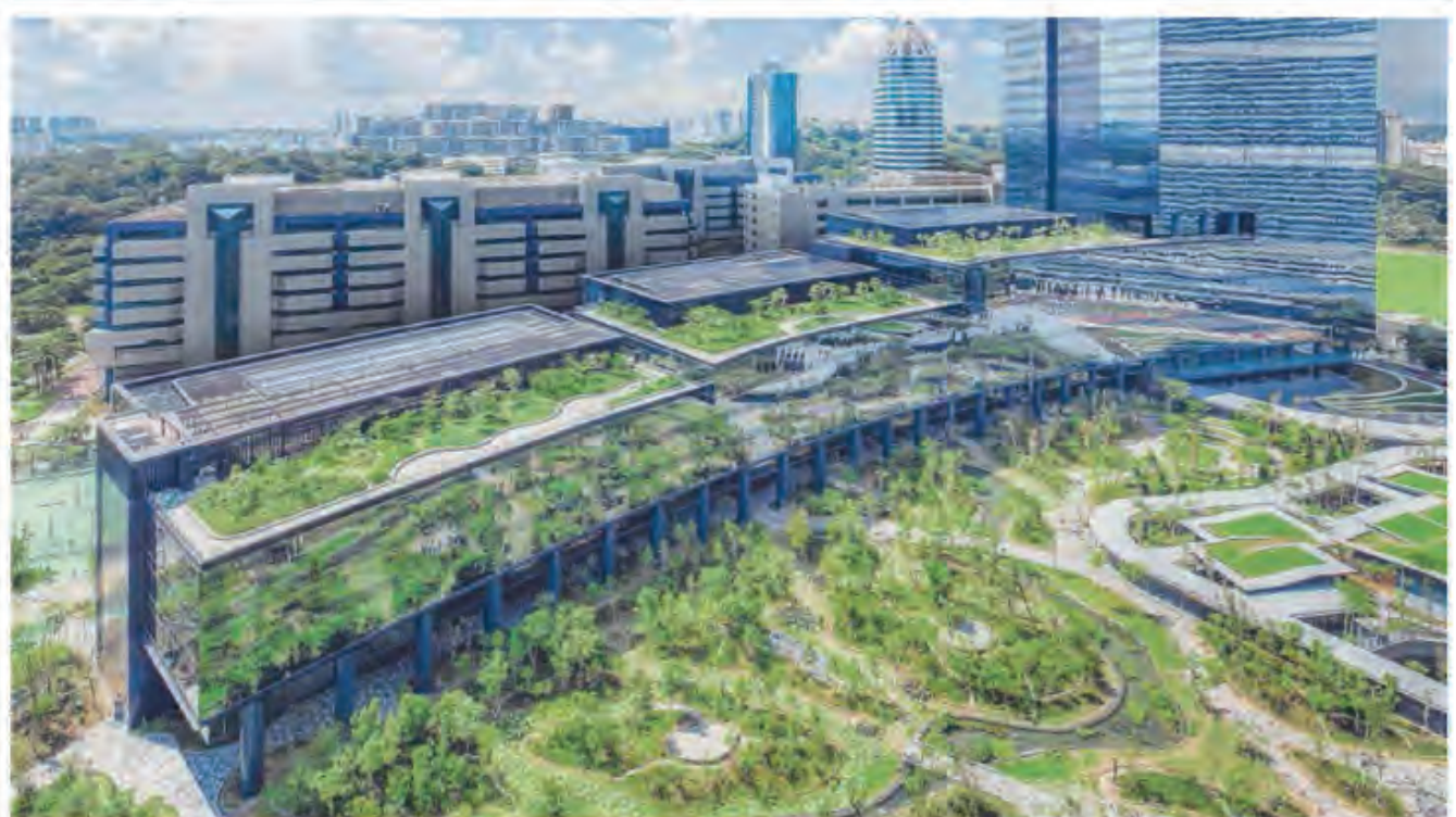
Mapletree Business City at Pasir Panjang features an outdoor garden amphitheatre and a lush central park located within the heart of the business park.