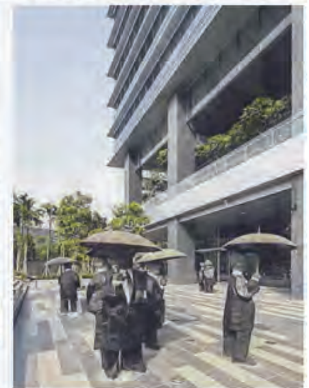
The Metropolis has notable artworks.