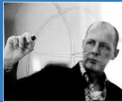
Ben van Berkel UN Studio (Netherlands)