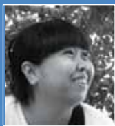
Patama Roonrakwit Community Architects for Shelter & Environment (Thailand)