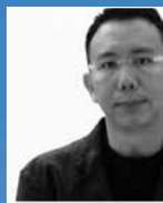
Thomas Kong Architecture, Interior Arch & Designed Obj (USA)